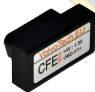
CFE-Plus CPU (OBD Male Dongle)

The following products are supplied in the CFE-Plus set: