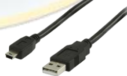
CFE-Plus USB cable